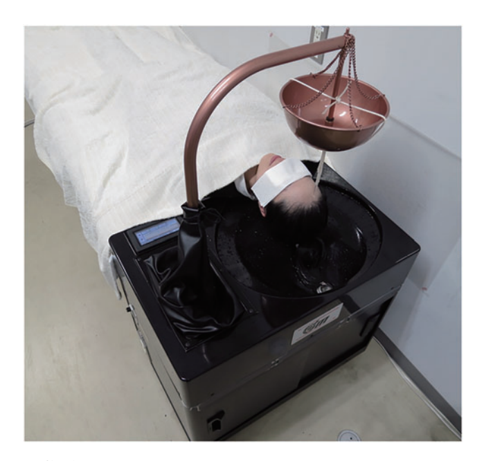
FIG. 3. Shirodhara robotic oil-drip system. The liquid was warmed and circulated inside the system and poured on the forehead of the subject through a bundle of cotton strings attached under the nozzle. The ends of the strings were set 8 cm above the forehead. Temperature, pattern, and flow speed can be specified. Color images available online at www.liebertpub.com/acm

Participants received Shirodhara in the supine position, with the eyes covered with cotton pads and gauze. The body below the neck was covered with a towel. Participants with long hair